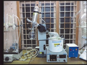
ROTARY VACUUM FLASH EVAPORATOR