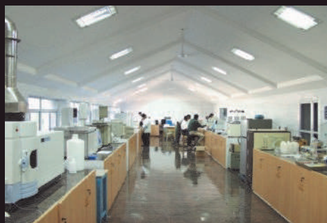
Instruments Lab - Marine sciences