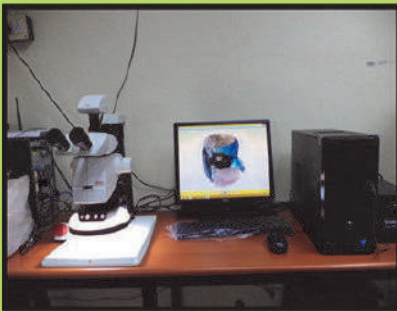
LEICA Stereo zoom microscope