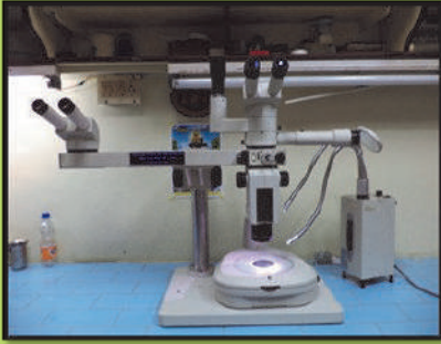
TRINOCULAR STEREOSCOPIC ZOOM MICROSCOPE